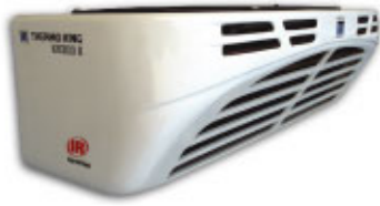
Direct Drive Unit KV-300II